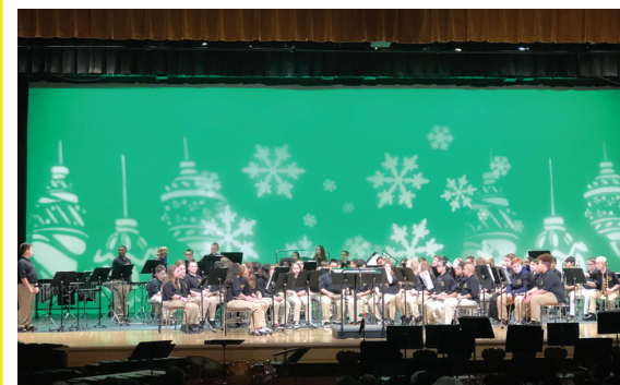
Bolich Middle Schoolers on stage, prepare for their performance Monday night at CFHS.

During the final week before the holiday break, students throughout the District gathered and got to show off their musical talents.