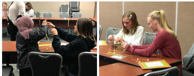
Students participate in one of the interactive sessions during the 2019 Diane Burbick Math & Science Conference.

experiences. The conference also featured interactive sessions with professional women who discussed their careers in environmental science, medicine, nutrition, marketing/consulting, and forensics. A key mission of this conference is to encourage the girls to continue to take challenging math and science courses in high school.